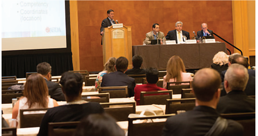
The annual conference features an array of educational sessions