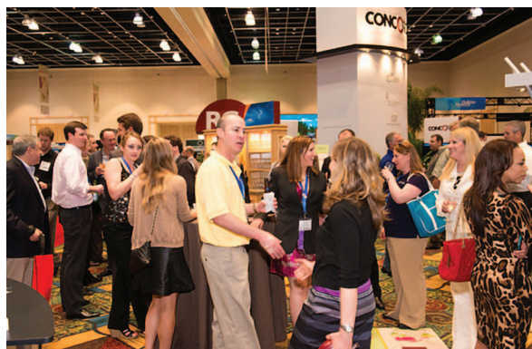
Attendees at the convention could visit with vendors in a lively exhibit hall